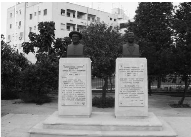
Busts of former Maronite leaders in the yard of the Maronite Archbishopric (dedications containing a prayer for return to the occupied villages).