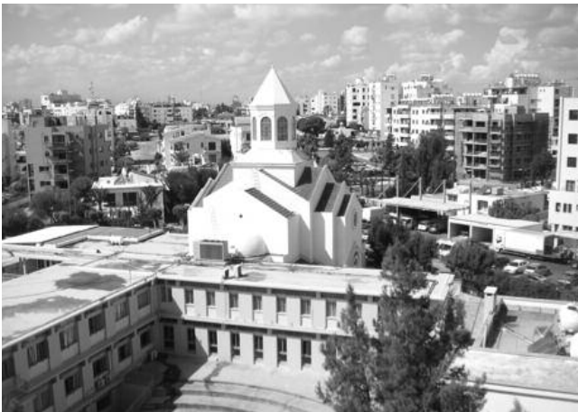
The Armenian primary school and Archbishopric tower built in the 'new' Armenian area developed after 1974.