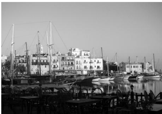
Kyrenia harbor in 2003