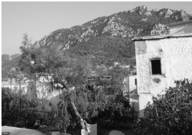
View of Pendarakhtylos mountain range from the village of Akanthou in 2011