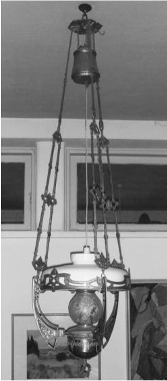
Antique lamp brought as wedding present from Akanthou.