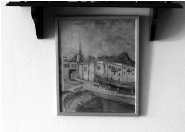
Sketch of Kyrenia harbor underneath a decorative shelf of a living room in Nicosia.