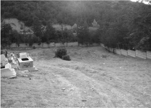
Part of the cemetery in Akanthou which has been razed.