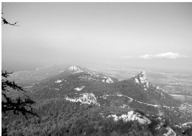
The Pendarakhtylos mountain range (view from Kantara castle in 2003)