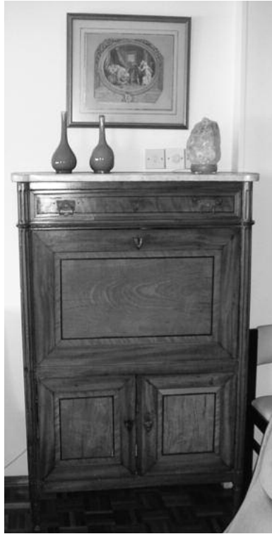
Antique chest salvaged from home in Varosha.